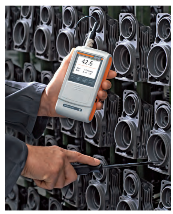
Measurements using the internal probe FAI 3.3-150