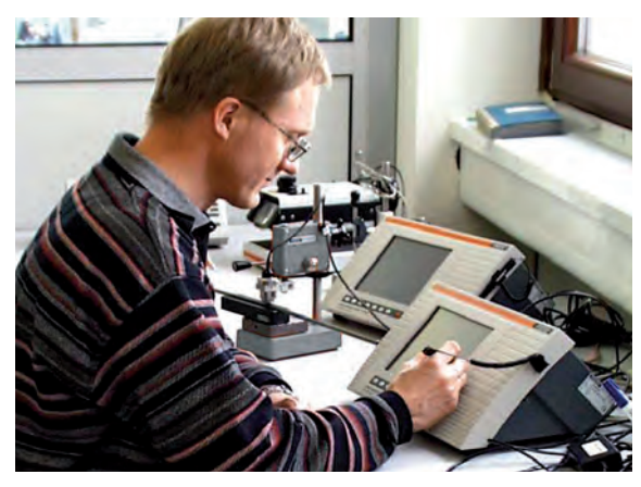
Measuring on a customer's specimen in a FISCHER application laboratory

More and more, demanding applications require highly qualified application advice. FISCHER addresses this need with its application laboratories located around the world (Germany, Switzerland, China, USA).