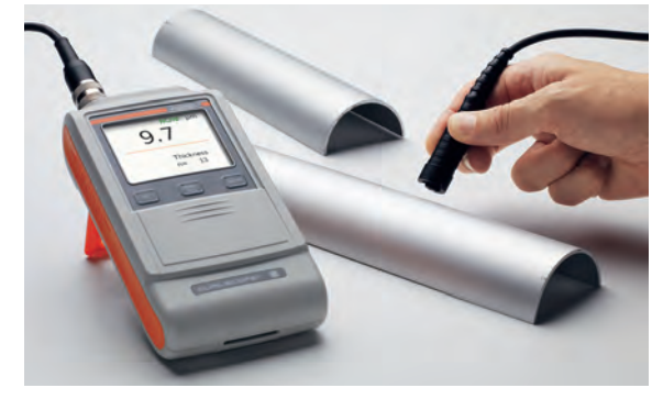
DUALSCOPE® FMP20 using the probe FTD3.3