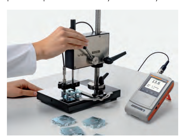
DUALSCOPE® FMP40 using the probe FGAB1.3 and support stand V12 BASE – measuring parts with position accuracy

The FMP30 and FMP40 instruments feature additional more memory for numerous customer-specific measuring applications as well as extensive graphical and statistical evaluations. Tolerance limits can be entered into the calibratable measuring applications and the production process can be analyzed statistically.