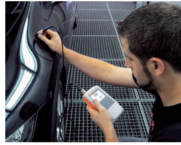
Paint coating thickness measurement using the dual probe FD13H