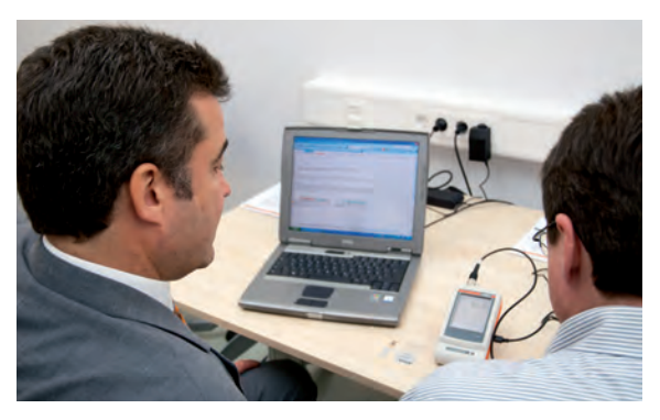
User training for the DUALSCOPE® FMP100 on-site at the customer's

With our training program we make your employees fit on-site for your measuring task. Our trainer takes account of your individual requirements and wishes.