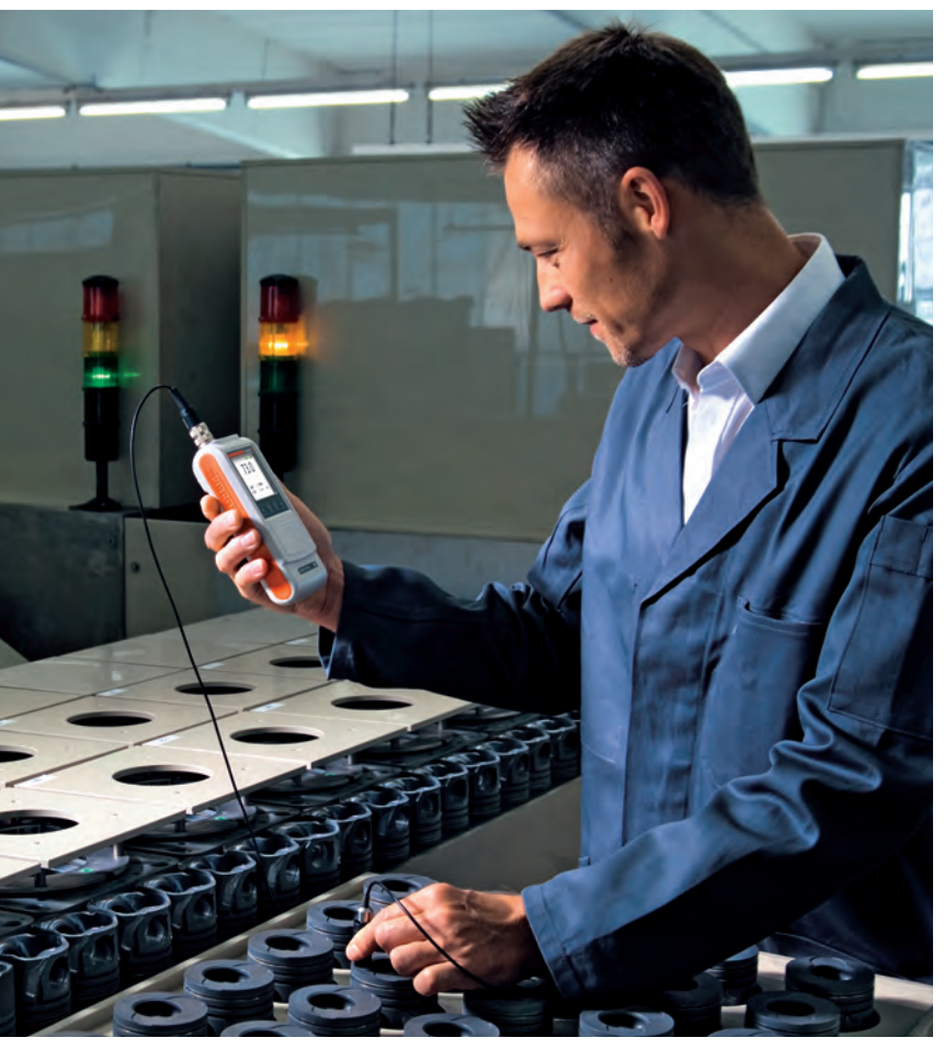
Quality monitoring on engine pistons immediately after the manufacturing process using the FTA3.3H probe

Select the appropriate instrument from the FMP family and combine it with one of our high-precision measurement probes.