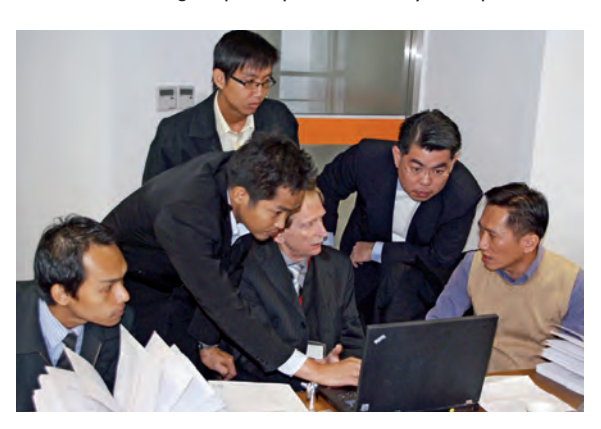
A FISCHER seminar teaches metrological basics and practical knowledge in small groups

Because we want you to receive maximum benefit from our products, FISCHER's experts are happy to share their application know-how. The seminars not only teach metrological basics but also hand-on experience in small groups to put the theory into practice.