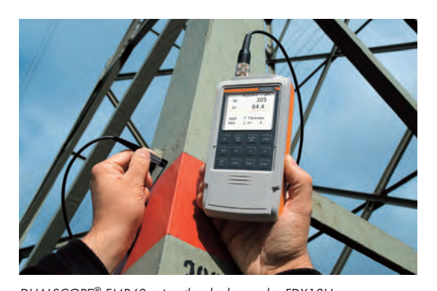
DUALSCOPE ^{\otimes} FMP40 using the duplex probe FDX13H

Due to automatic base material recognition and the integration of both measurement methods, these universal instruments are capable of measuring coatings on steel and iron (F) and on non-ferromagnetic metals (NF). Duplex coatings (lacquer/zinc) on steel can be measured simultaneously with the values of the lacquer and zinc coatings displayed individually.